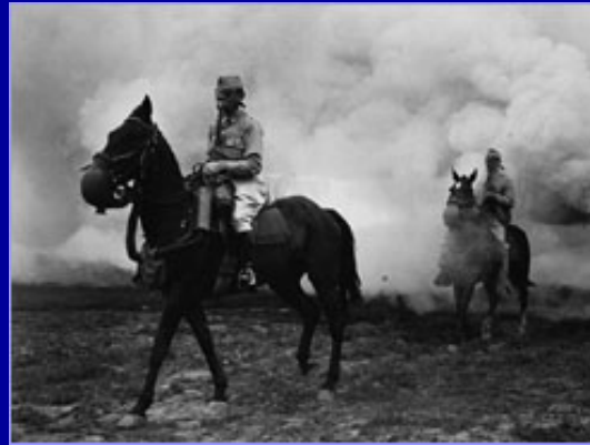
After the war, cavalries were trained to expect attacks with chemical and biological weapons.

The United States signed the Protocol, yet 50 years passed before the U.S. Senate voted to ratify it. Japan also refused to ratify the agreement in 1925.