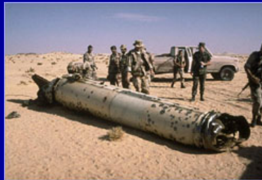
During Operation Desert Storm, the U.S. military feared that Scud missiles might contain biological agents.

What is almost certain, though, is that this arsenal still exists in 2001. In fact, with the aid of former Soviet experts and UNSCOM inspectors kept at bay, the Iraqi arsenal is likely growing in power.