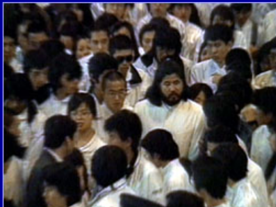
The Aum Shinrikyo cult claimed tens of thousands of members.