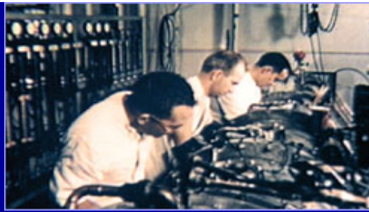
Weapons production at Fort Detrick, Maryland, the U.S. Army's base for biowarfare research.

In 1969, the U.S. military celebrated the success of a massive field test in the Pacific. The wargame—involving a fleet of ships, caged animals, and the release of lethal agents—provided proof of the impact of bioweapons. Little did the U.S. team know, however, that Soviet spies were in nearby waters, collecting samples of the agents tested.