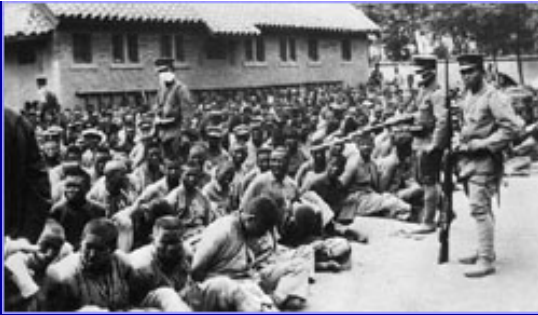
The Japanese army used Chinese prisoners to test bioweapons. (These particular men may not have been subjects.)

biological weapons in World War I, the Japanese military practiced biowarfare on a mass scale in the years leading up to and throughout World War II. Directed against China, the onslaught was spearheaded by a notorious division of the Imperial Army called Unit 731.